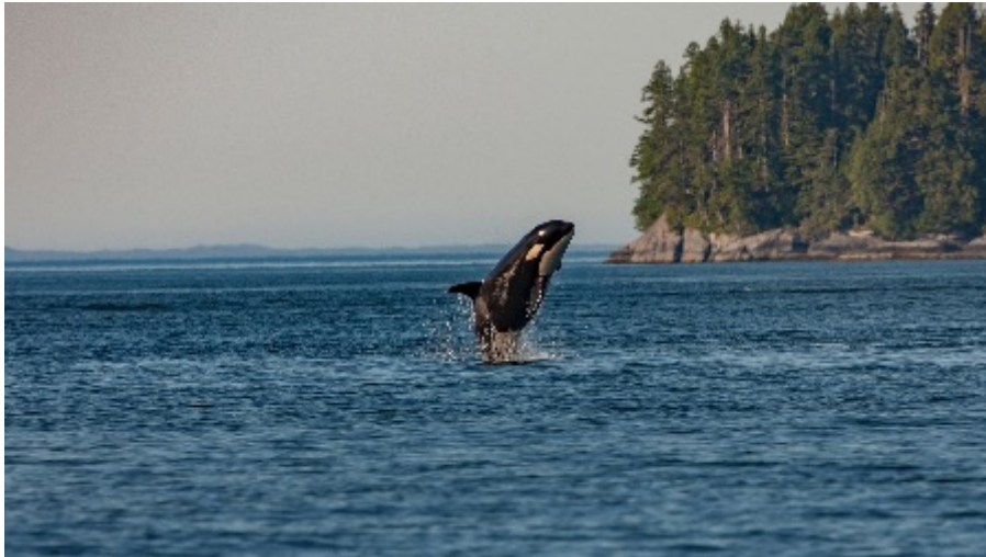
Majestic orcas, part of the beauty of the Pacific Northwest, are in danger from proposed U.S. Navy testing.

The League takes action on environmental concerns as well as democracy and voting issues. We often testify in the legislature in favor of preserving our environment and reversing the damage already done, actions that improve both human and natural health and address climate change. In recent legislative sessions, we have supported bills to reduce water pollution; preserve the health of rivers, streams, and shorelines; and restore our natural salmon stocks. Many of the bills also help protect and restore the health of our southern resident orcas, an iconic species in our state, which are regrettably in decline.