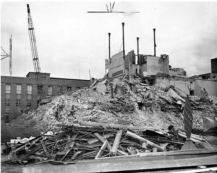
1961 demolition of the old Yakima County Courthouse.

"The League continued its interest in city government and in 1966 published a financial survey, 'Making Dollars Out of Sense.'"